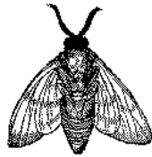
Figure 2: A sample black and white graphic (.eps format) that has been resized with the epsfig command.

This sample document contains examples of .eps and .ps files to be displayable with L A T E X. More details on each of these is found in the Author's Guide .