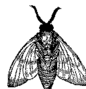
Figure 2: A sample black and white graphic ( .eps format) that has been resized with the epsfig command.

Note that either .ps or .eps formats are used; use the \epsfig or \psfig commands as appropriate for the different file types.